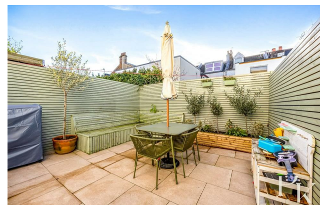
Cowper Street, Hove, BN3 5BN Asking price £750,000 - Freehold